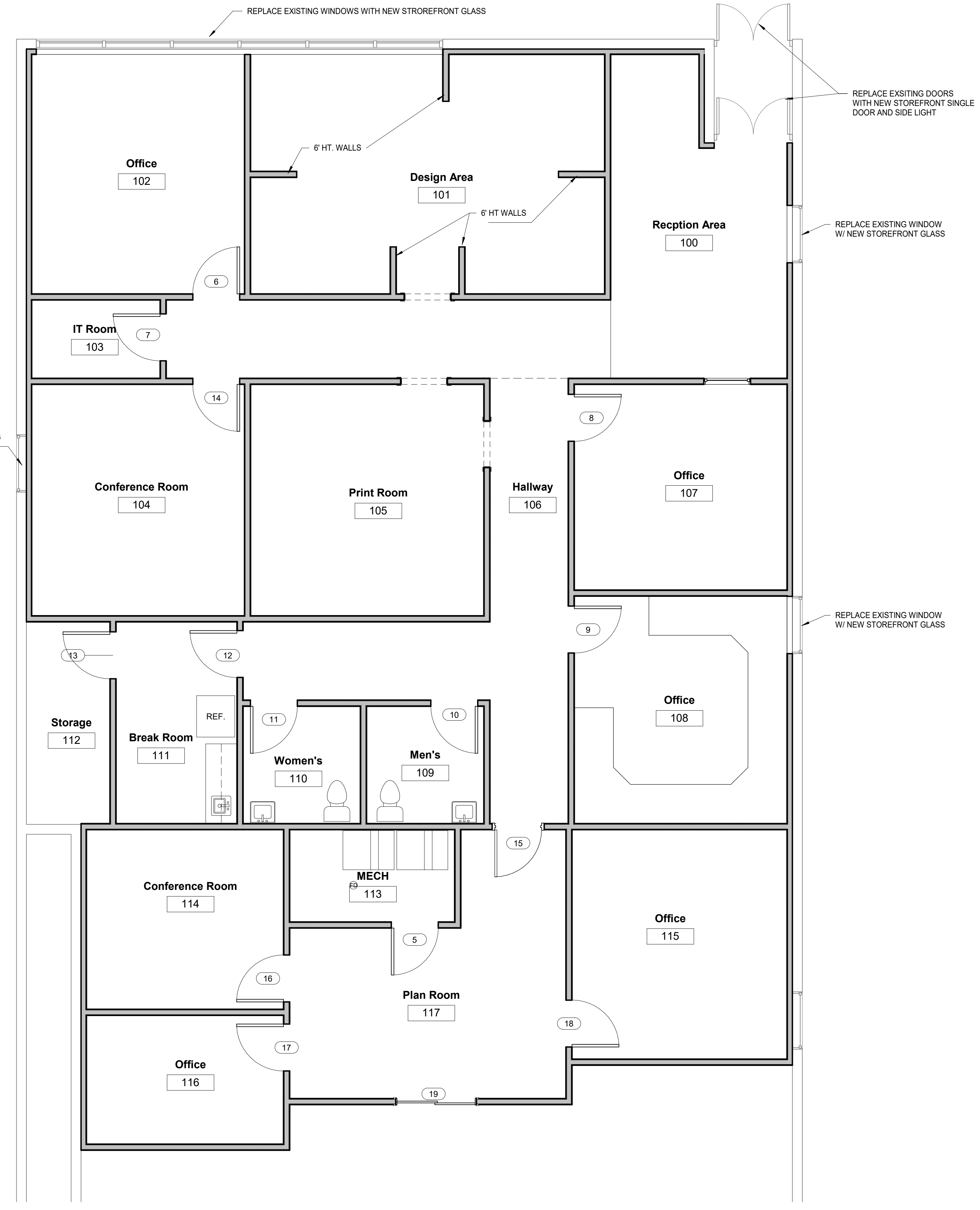
2 Callout of Floor Plan 1/4" = 1'-0"